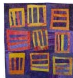
Firebrand Improvisational Piecing

WORKSHOP REQUIREMENTS: The tutor will supply materials so that students can sample each technique. However, for your own projects, you will require a fair collection of scraps suitable for the technique(s) that you choose to focus on. Potentially multiple techniques can be used in the same quilt