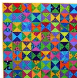
For Finn Hourglass Blocks (ideal for charm squares)