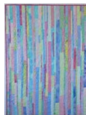
Prettily Pastel Foundation Piecing