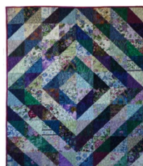
Floral Diamonds Half Square Triangle