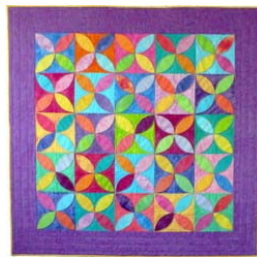
Spring Petals Fusible Web Appliqué