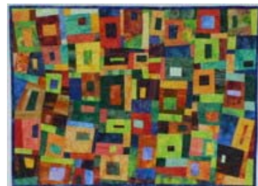
Autumn Splendour Improvisational Piecing (Multi-width strips)