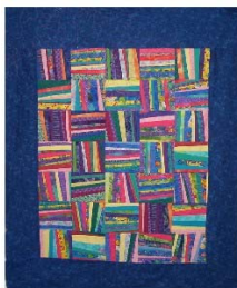
Springtime String Piecing (ideal for strips)

Images are indicative only and represent what can be achieved using the techniques learned.